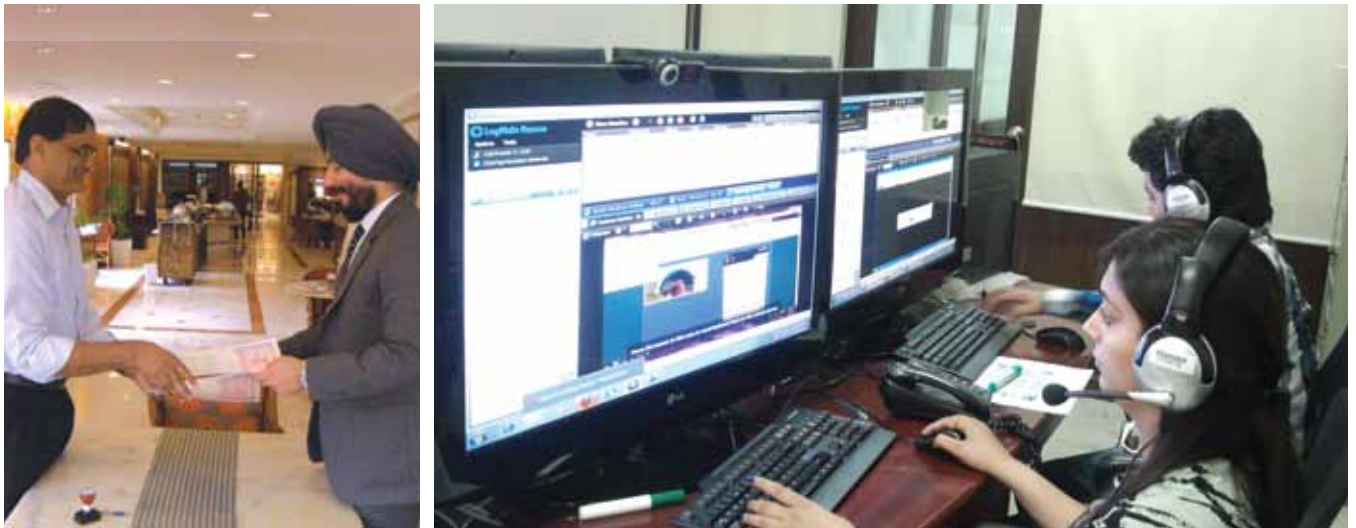
The university ventured into On-Line and Distance Education (DBU Global) on 8 December 2010 to reach out to the nooks and corners of our vast country and the world where Don Bosco institutions operate in 132 countries