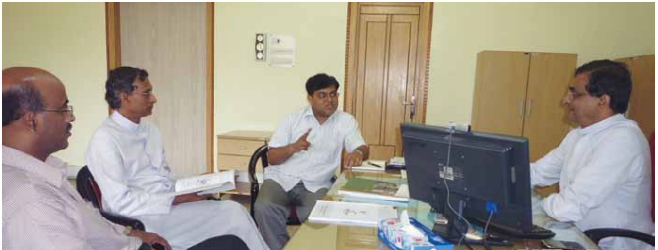
The University signed a Memorandum of Understanding (MoU) on 07 October 2011 with DBTech, which has 123 technical institutions in India, with a view to standardization of training programmes, certification of the Courses of Study, and digitalization of the course contents for on-line delivery.