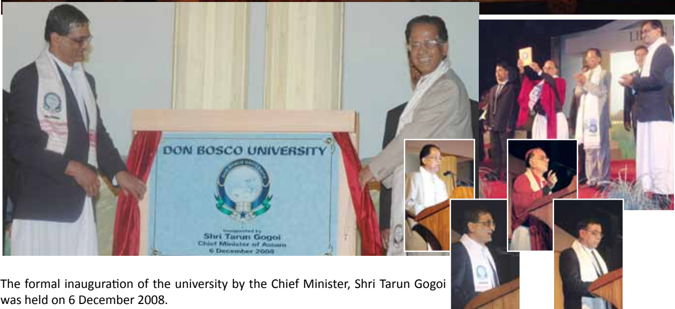
The formal inauguration of the university by the Chief Minister, Shri Tarun Gogoi was held on 6 December 2008.