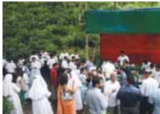
Ground-Breaking and Blessing Ceremony at University's Main Campus at Tapesia Gardens in Guwahati was held on 15 June 2012.