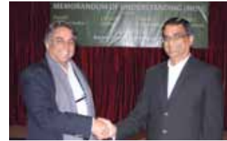
The University signs MOU with 'Classle Knowledge', 'I Create India' and 'PanIIT India' on 25 January 2012