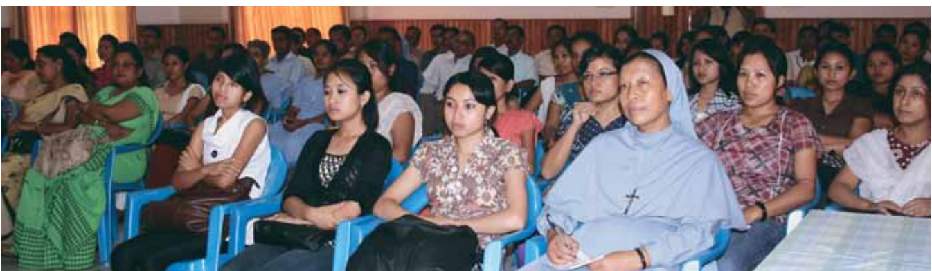
23 August 2011 saw the launch of two new post-graduate programmes: Masters in Social Work (MSW) and Masters in Technology (M Tech). More significantly, 22 doctoral students (Ph D) started research in 8 disciplines on the same day.