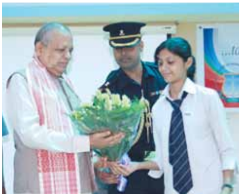
His Excellency, Shri Janaki Ballav Patnaik, Governor of Assam and Visitor to the University inaugurated the academic year on 27 July 2010.