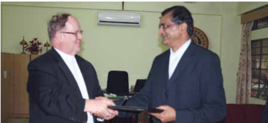
The University signs MOU with DeSales University (Pennsylvania, USA) on 7 March 2012 for student and staff exchange programmes, for collaboration in on-line courses, for joint research on and development of educational leadership projects.

The University signs MOU with University of Arkansas – Little Rock (Arkansas, USA) on 13 March 2012 for semester abroad programmes for the engineering students, for exchange of staff and students on a routine basis, for joint certification and/or dual certification of degree programmes, for facilitating visits by professors and research students.