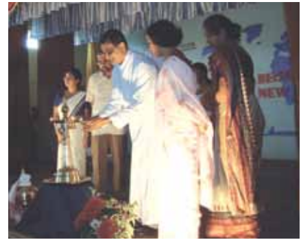
The first graduate courses in Technology and Engineering (B Tech) at Azara began on 11 August 2008