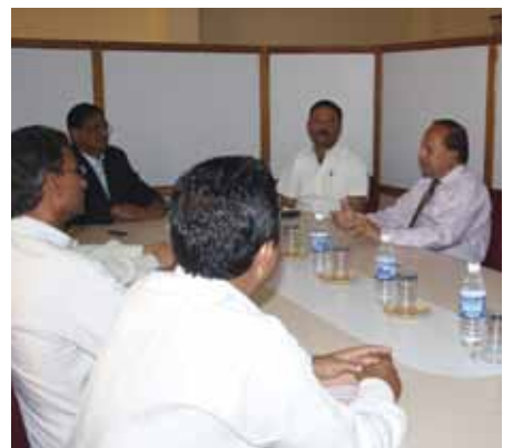
The University's Training and placement Office at Azara, sponsored by NEEPCO was inaugurated by Shri I P Barooah, CMD, NEEPCO, on 14 March 2011.