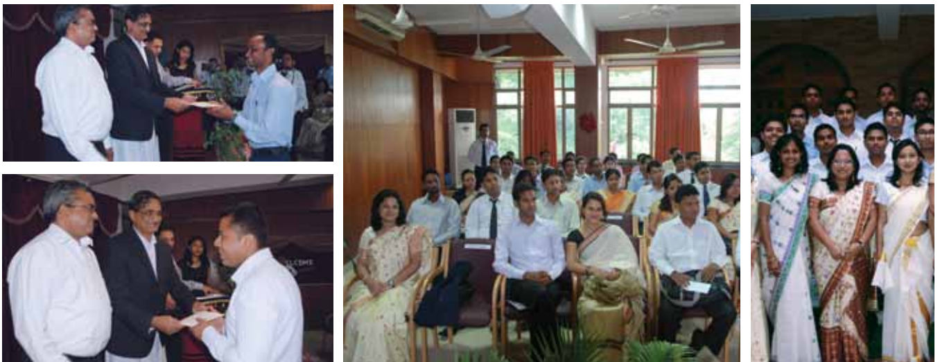
The first batch of 33 graduates in Business Administration (MBA) were awarded their Degrees on 9 June 2011.