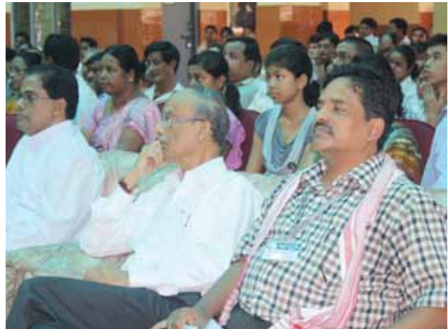
The Civil Engineering (B Tech) was inaugurated on 26 July 2011.