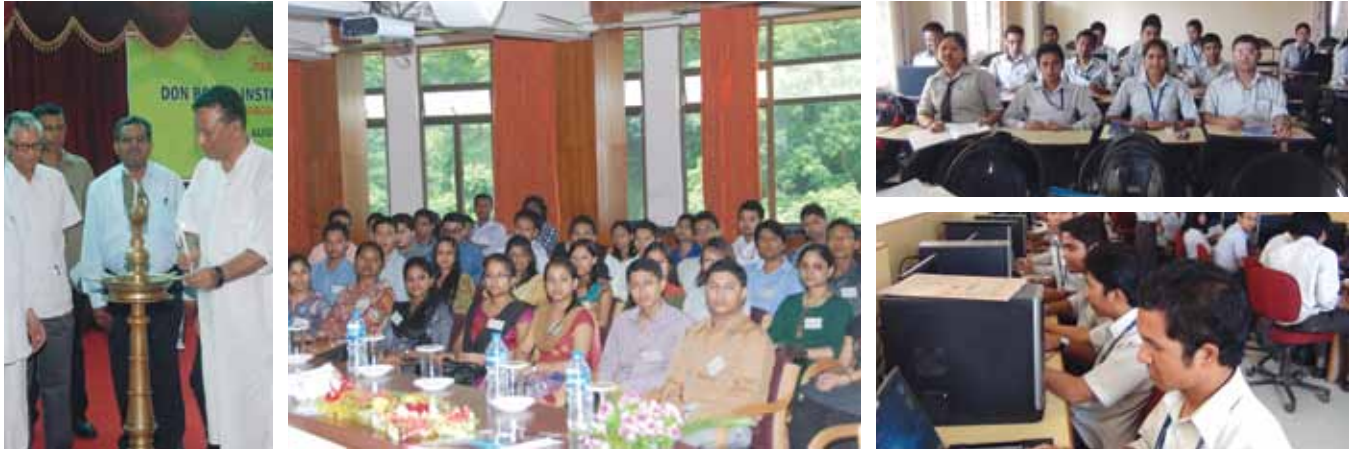
The first post-graduate course in Computer Science (MCA) at Azara started on 20 August 2009, and Management in Business Administration (MBA) at Don Bosco Institute of Management, Kharghuli on 27 August 2009.